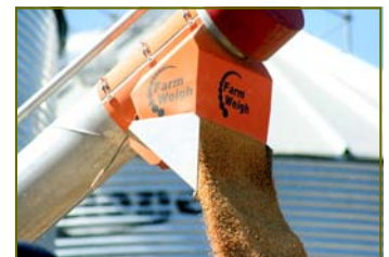
The new FarmWeigh weighhood is better made, will last longer and provide more accurate and consistent results

We at FarmWeigh believe that an ongoing product development program ensures our future and provides our customers with the most up to date design and quality.