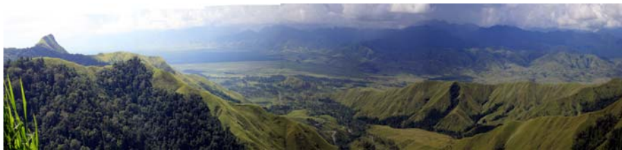
Left: The beautiful scenery of the Eastern Highlands in Papua New Guinea