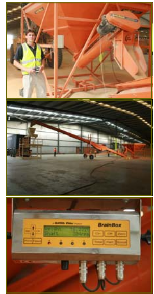
Top: AWH's James Phyland operates the system with a small control box. Middle: The entire system, including the Aust-Mech Tubeveyor. Bottom: The FarmWeigh digital indicator, which is interfaced to a PLC system

See our website for more info on the Mantis™