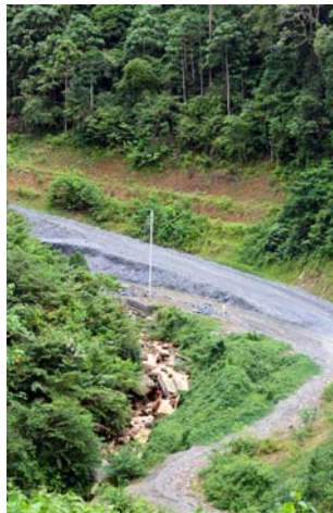
The road winding from the Barrick Kainantu Gold Compound up to the 800, 1300, 1400 and 2000m mine entrances. Steep, winding and surrounded by jungle.