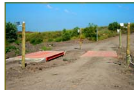
The FarmBridges by day, note the E-Tag readers in the foreground

Utilising FarmWeigh's Ton-Tel™ software they have two fully automated weighbridges to ensure all vehicles are weighed efficiently and overloaded trucks are not going onto the road.