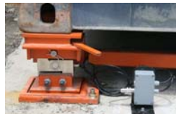
Close-up of the one of the 12t loadcells