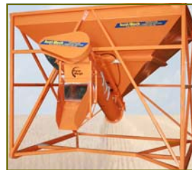
The Mantis™ plus

"The Mantis™ enables the user to load into or out of silos or other grain storage using any of the farm conveyors, whether an auger or belt conveyor."