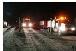
The FarmBridges in action at night at 90 trucks per hour

"Rockin Haulage installed 2 FarmBridges™ from FarmWeigh with E-Tags to identify the 200 or so truck and dogs moving the fill"