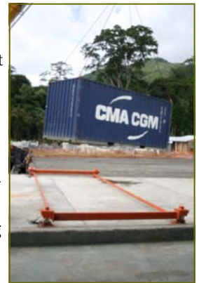
Shipping container being loaded onto the scale ready for filling

This installation provides for a visual alert when the target weight is reached, however, it can also be configured, through a control system, to automatically slow the fill down upon reaching target weight one and stop the filling when target weight two is reached. This enables totally automated filling and improves logistics, re-filling delays and eliminates overloading rejections.