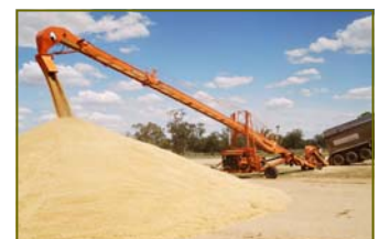
Aust-Mech's recognisable eyes on one of their Tubeveyors

The winner is the market, where they will get a more complete service and integrated conveying, handling and weighing systems.